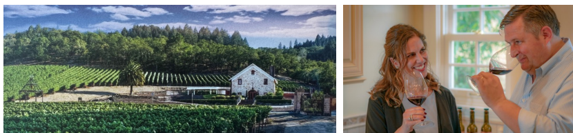
The Morlet Family Vineyards Estate in Saint-Helena, Napa, CA, USD