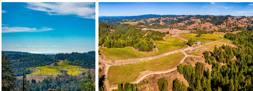
Your vineyard is located in Fort-Ross Seaview, Sonoma, CA, USA.