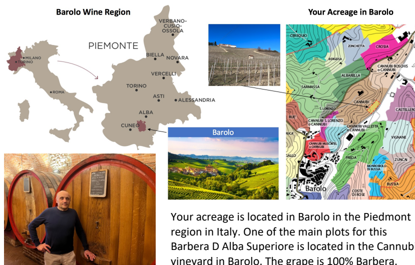
The wine maker: Enzo Brezza

Your acreage is located in Barolo in the Piedmont region in Italy. One of the main plots for this Barbera D Alba Superiore is located in the Cannubi vineyard in Barolo. The grape is 100% Barbera.