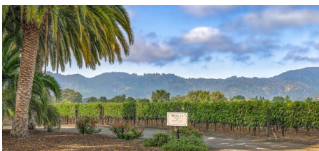
The Coeur de Vallée Vineyard