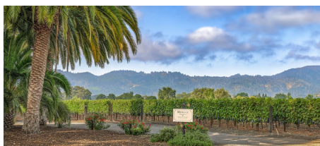
The Coeur de Vallée Vineyard